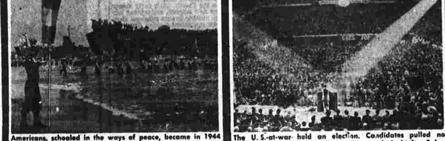
Americans, schooled in the ways of peace, became in 1944 unsharpened veterans of attack and definitely attained military ever troops of the war lords—east and west.

cause one shop affected had been seized and was operating under an executive order as an outgrowth of a machinists' strike several months ago. It informed the shop's 20 lithographers, by individual telegram, that "failure to report promptly to work as ordered will result in the imposition of sanctions provided by law."