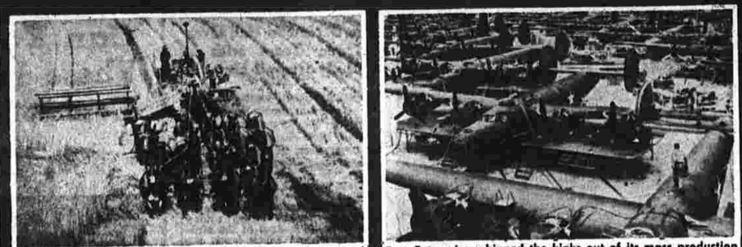
The land of freedom is fertile. Despite shortages of men and machinery, farmers this year grew record crops. The U. S. Army is the world's best fed and to is the U. S. civilian.